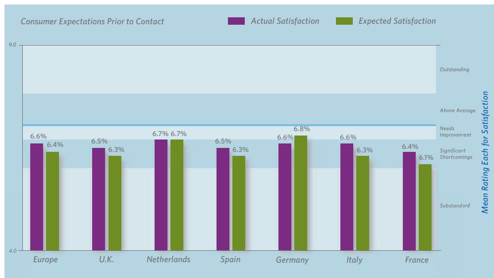
Figure B

Clearly, companies need to take a closer look at how their contact center fits with their overall customer strategy. It’s time to reconnect the contact center experience with consumer expectations.